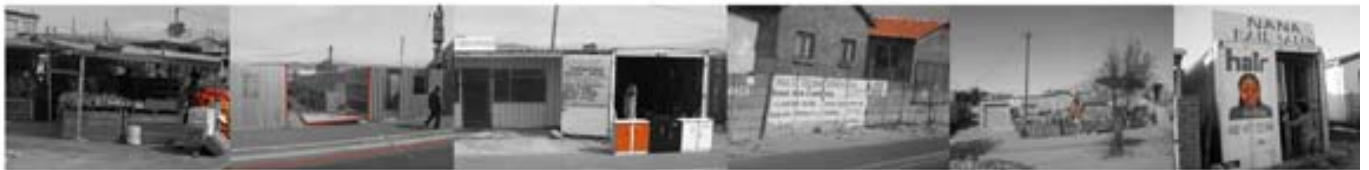
Local knowledge and expertise

The current situation is dire, people are dying, children are starving, crime... The site development is based on a programme whereby impoverished communities can develop both continual training systems whilst improving holistic living conditions. By engaging with the community we further reinforce the growth patterns of the project to give a sense of ownership.